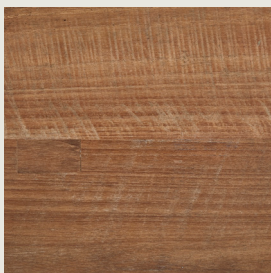
Variant: Reclaimed Teak