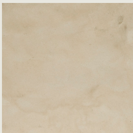
Variant: Light Sand