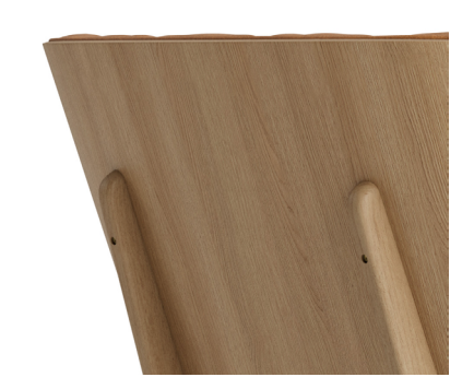
NATURAL OAK DUNES COGNAC 21000