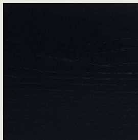
Variant: Black Oak