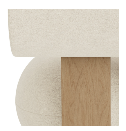
NATURAL OAK BARNUM BOUCLE COL 24