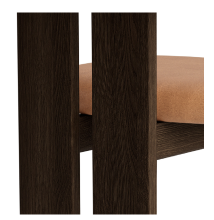
DARK SMOKED OAK DUNES CAMEL 21004