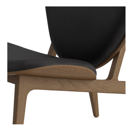
LIGHT SMOKED OAK DUNES ANTHRAZITE 21003