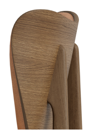
LIGHT SMOKED OAK DUNES CAMEL 21004