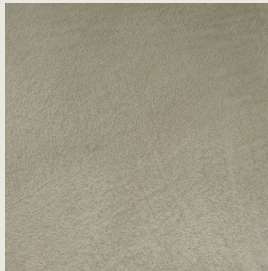
Variant: Wabi Sabi